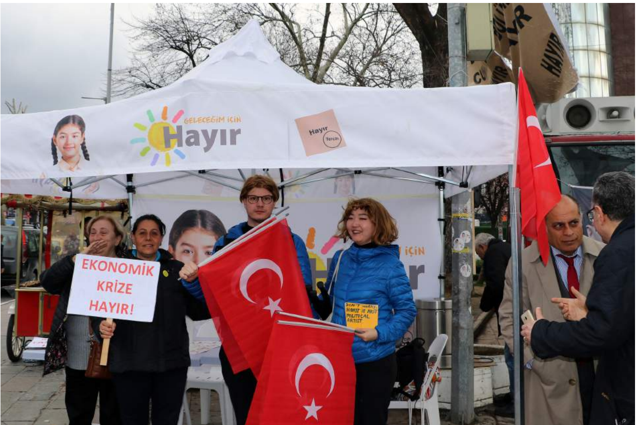
Performance „Horst & Maria“, Istanbul 2017.