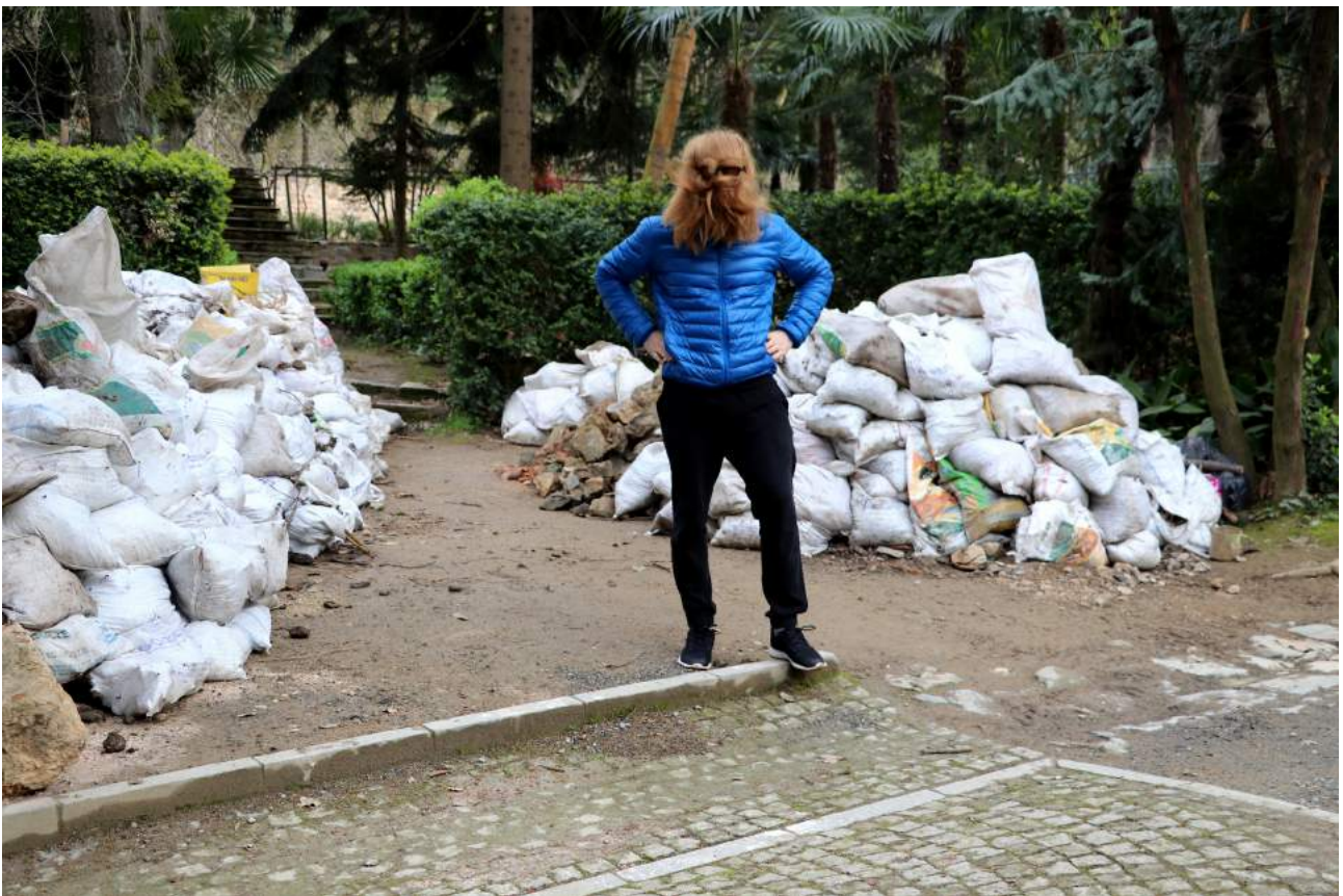
Performance „Horst & Maria“, Istanbul 2017.