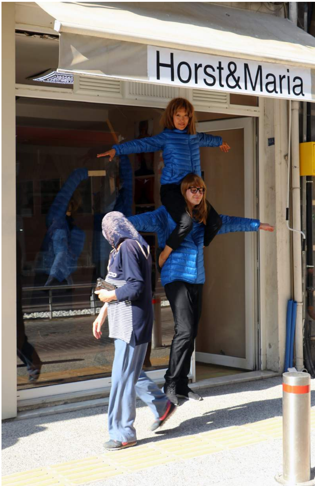
Performance „Horst & Maria“, Istanbul 2017.