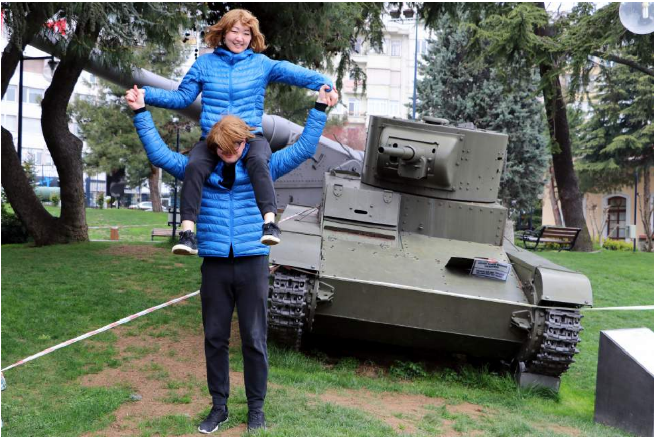
Performance „Horst & Maria“, Istanbul 2017.