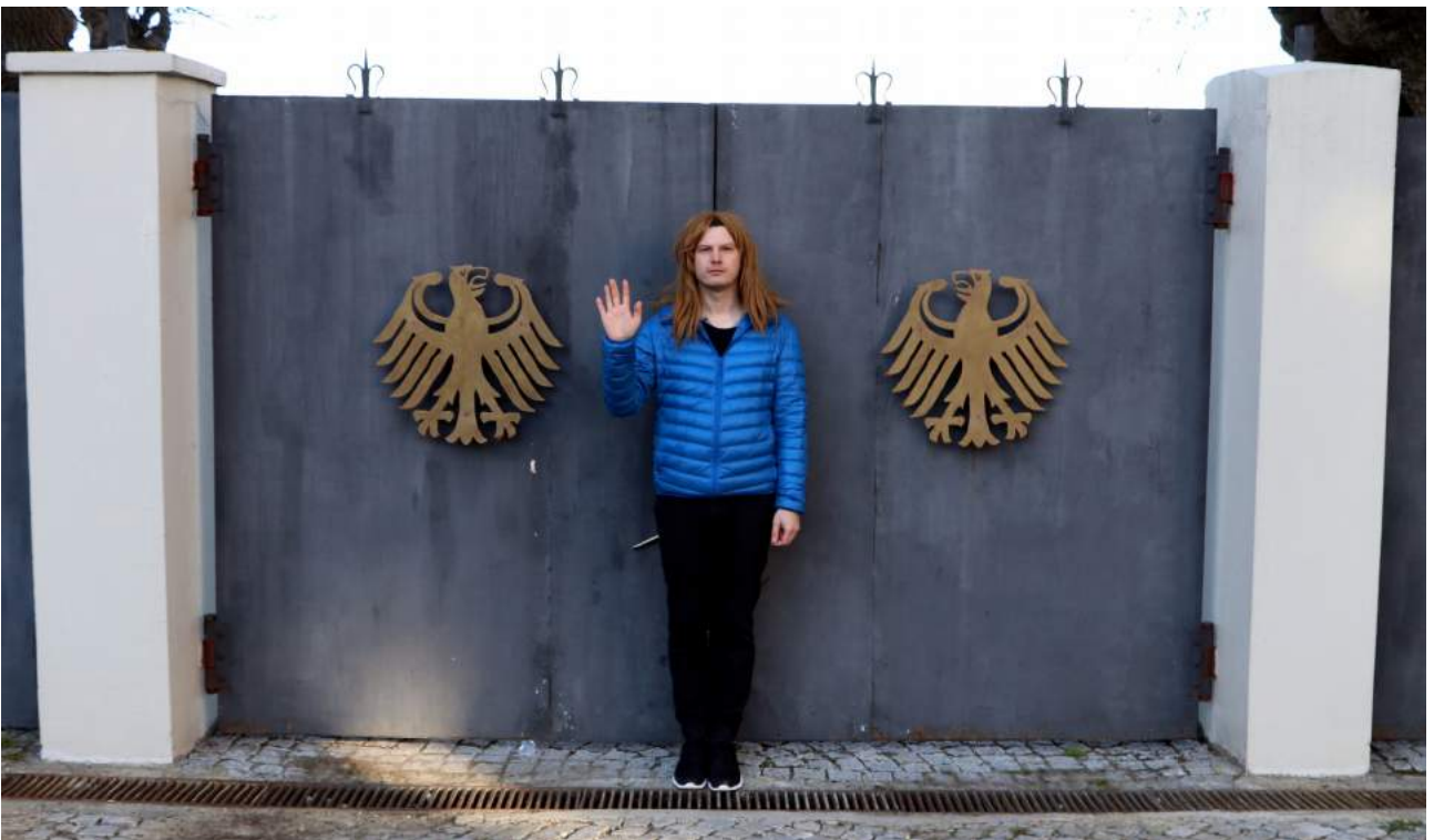
Performance „Horst & Maria“, Istanbul 2017.