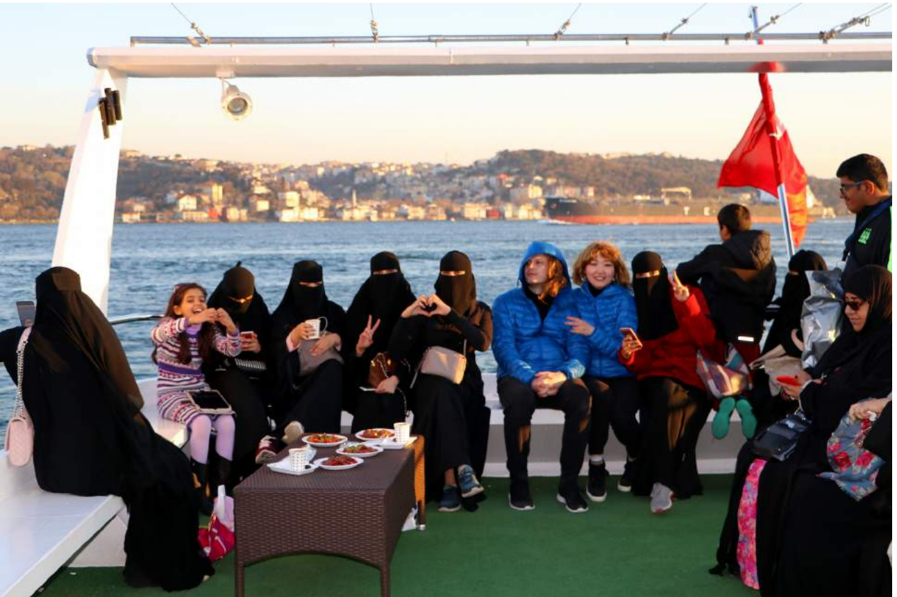
Performance „Horst & Maria“, Istanbul 2017.